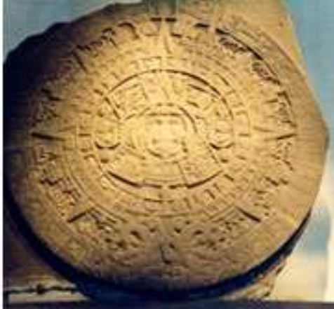
The Maya Long calendar (Tzolkin calendar)

It doesn't look "long" to me, it rather looks kinda round but in any case this is the object which announces doomsday to us