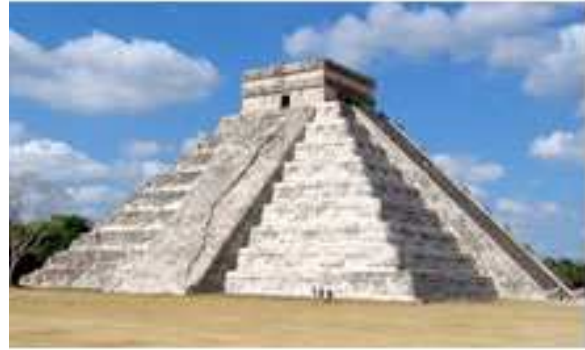
MAYA "OBSERVATORY" PYRAMID

It doesn't look "long" to me, it rather looks kinda round but in any case this is the object which announces doomsday to us